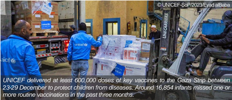
UNICEF delivered at least 600,000 doses of key vaccines to the Gaza Strip between 23-29 December to protect children from diseases. Around 16,854 infants missed one or more routine vaccinations in the past three months.

Reporting Period: 28 December 2023 to 3 January 2024